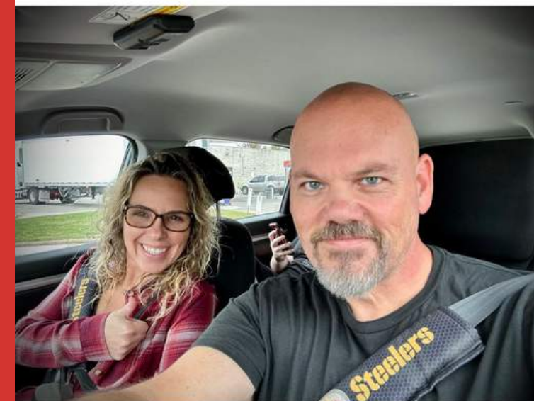
Liked by 2krazyketos, paleobarbie and 85 ready_setketo And we are off! Heading to Louisville for KPL!! Safe travels to everyone!! 🍀🍀🍀 can't wait to see you! #KPL #ketopalouza2023